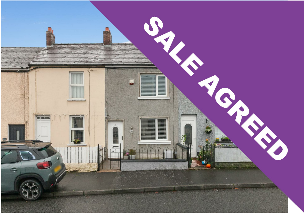
329 Carnmoney Road, Newtownabbey, BT36 6JT